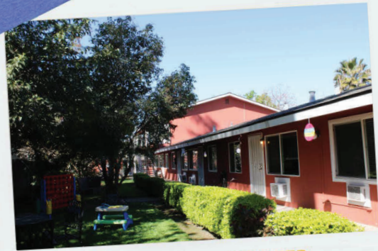
FAMILY HOPE SHELTER