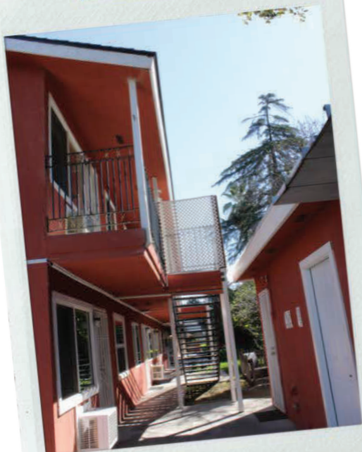
FAMILY HOPE SHELTER