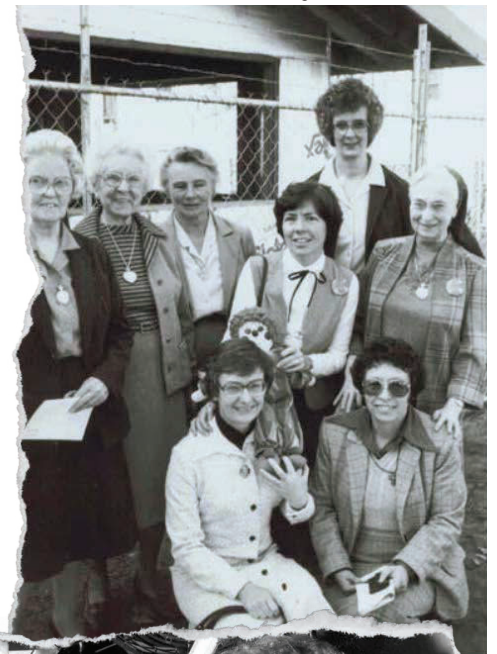
Sisters of the Holy Cross served in the Holy Cross Clinic.