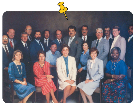
1990 Board of Directors