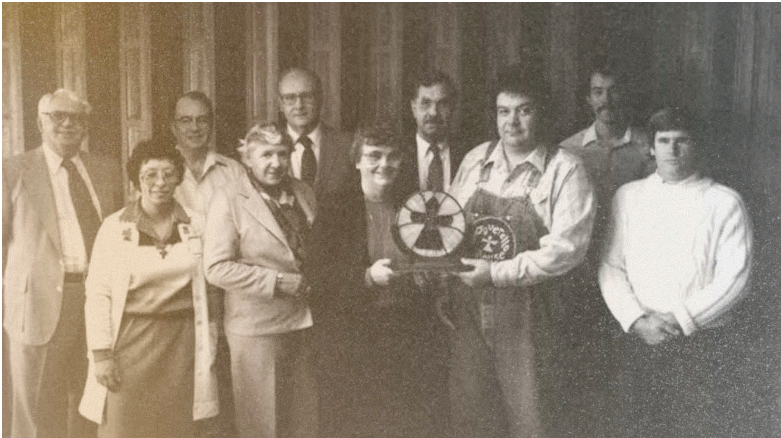
First Poverello House Board of Directors