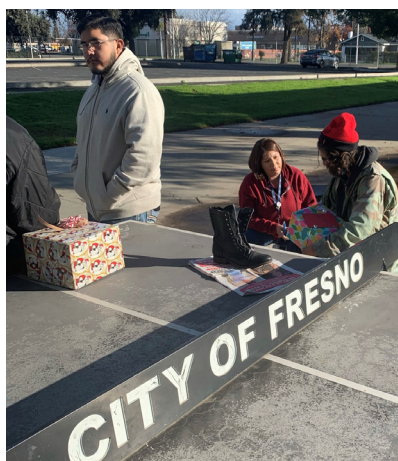
HOPE Team giving out gifts to those unhoused in the community

In our emergency shelters, the Village of Hope and Naomi's House staff decorate the shelters as if they are our homes. There are Christmas trees, snowflakes, twinkling lights, and presents. The goal is to provide them with home-like celebrations to encourage them to work towards providing their own festivities in their own home. The HOPE Outreach team provides warming kits, blankets, and items to combat the chilly, foggy night for those unsheltered during the holidays. The HOPE Team also provides a handwritten Christmas card with messages of hope and encouragement. It is to remind them that they matter no matter the circumstances.