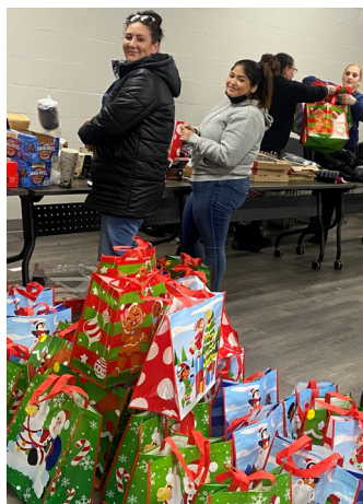
Shelter Staff assembling gifts for clients at Village of Hope and Naomi's House

Poverello House also provides holiday magic for those families who cannot provide gifts for their children because of financial reasons. Every year, Poverello House gives out over 3,000 toys to children who may not be able to have a present on Christmas Day. We want every child to feel the holiday joy of unwrapping a new toy and snuggling with stuffed animals. While getting their presents, the children get to walk through a winter wonderland complete with snow, music, and Santa. We hope that these children remember that their community cares about them despite their circumstances. For Poverello House, the holidays are a time for everyone who passes our way to feel loved and cared for.