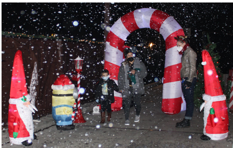
Christmas Eve 2021

Every year, Poverello House hosts a holiday party for Men's Rehabilitation program and their families. The men pick out and wrap presents for their children. They sit with their families, share a meal and take pictures with Santa and their children. It is a time that the family members see their loved one hopeful and happy without using substances. It is a time when residents see the positive impact they have on their loved ones when sober.