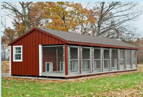
The new kennel for unhoused pets coming to Poverello House soon.

Poverello House strives to provide clients with services with respect, dignity, and relentless hospitality. This philosophy applies to their pets. We understand that pets provide clients with emotional support and unconditional love. However, animal services are limited in Fresno County for those experiencing homelessness. Many clients struggle to provide their pets with vaccines, medical care, and spay and neuter services. To address pet needs, Poverello House partners with Westside Rescue to provide vaccinations and preventative care to clients' animals. Westside Rescue volunteers work with the clients at Poverello House to provide vaccines and transportation to spay and neuter services. Poverello House is also working to provide a safe and clean environment for pets while their owners seek services. This month, Poverello House will install a climate-controlled, aesthetically pleasing kennel for shelter clients and clients utilizing Poverello House's resources. In the upcoming year, Poverello House will work with veterinary providers such as the Valley Animal Center to ensure that our client's pets receive the care they need to thrive.