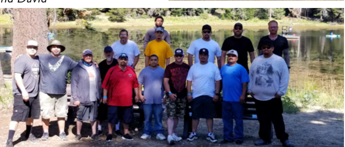
Men's Rehab Trip