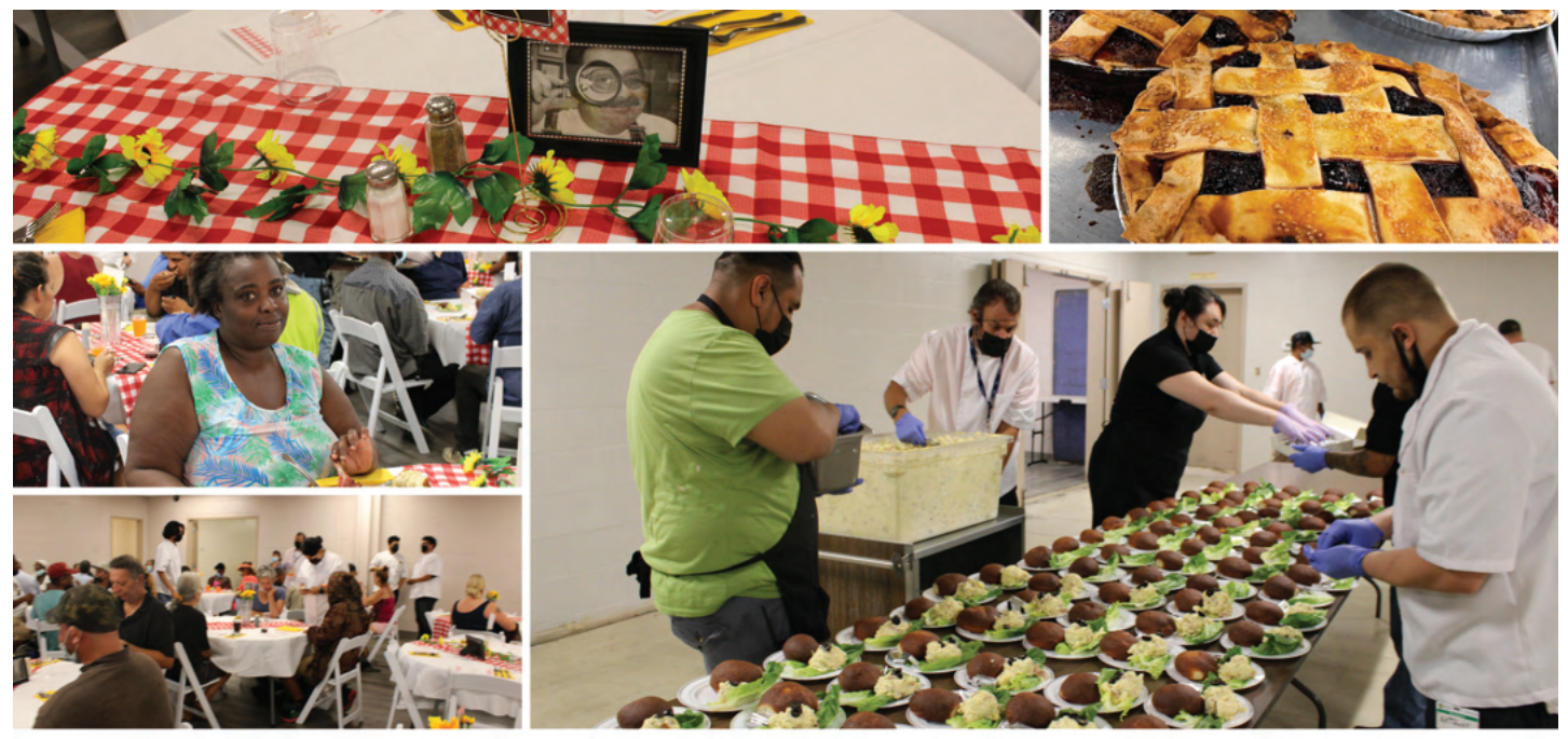
August Papa Mike's Café