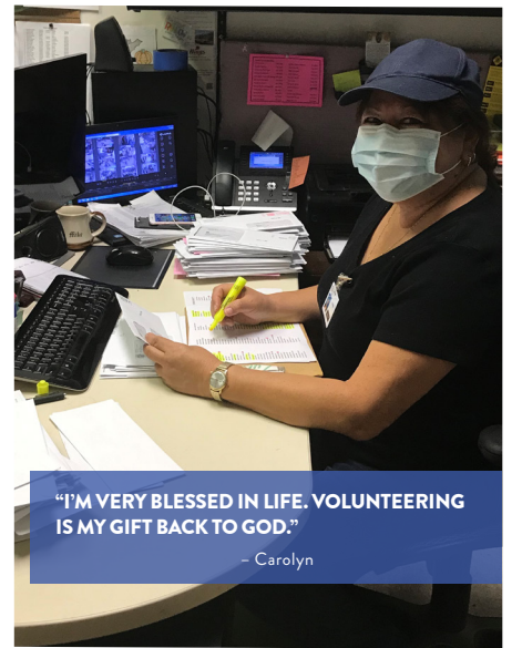
"I'M VERY BLESSED IN LIFE. VOLUNTEERING IS MY GIFT BACK TO GOD."