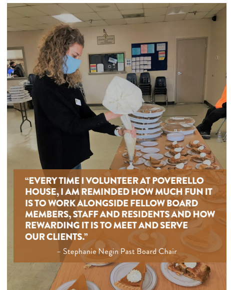
"EVERY TIME I VOLUNTEER AT POVERELLO HOUSE, I AM REMINDED HOW MUCH FUN IT IS TO WORK ALONGSIDE FELLOW BOARD MEMBERS, STAFF AND RESIDENTS AND HOW REWARDING IT IS TO MEET AND SERVE OUR CLIENTS."