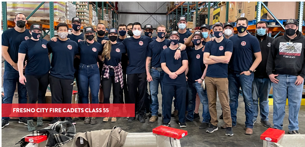
FRESNO CITY FIRE CADETS CLASS 55